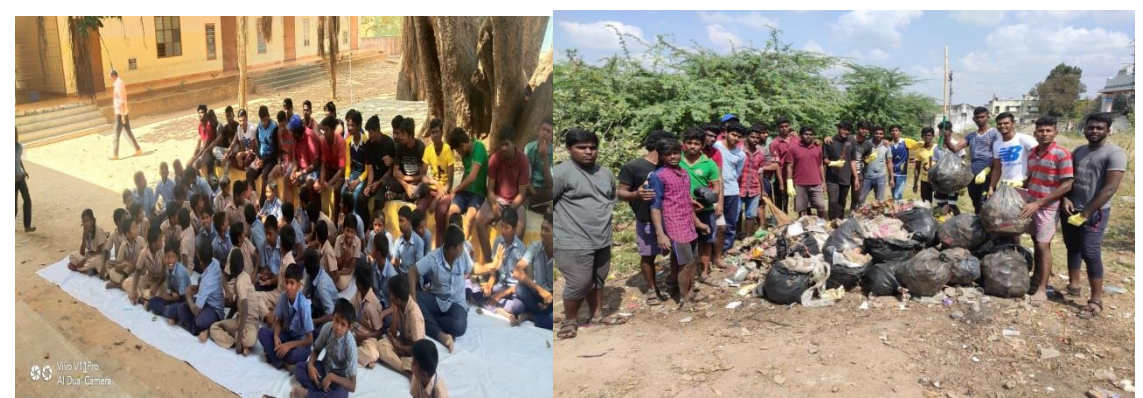
Volunteers resumed their cleaning activity from 3.30 pm to 5.30 pm. Cleaning was done on the main road near the school campus. Plastic wastes and other wastes in the cleaning areas were removed with proper utilization of equipments. Refreshments were provided to the volunteers.

Day 4 activities of the special camping programme began at 6.30 am with volunteers engaging in public places cleaning. Places adjacent to the Arni river bridge and neighbouring areas were cleaned. Volunteers had tea in the midst of the cleaning activitiy. Plastic wastes and other wastes in the cleaning areas were removed with proper utilization of equipments. All the volunteers were actively engaged in all activities with passion and interest. After breakfast, volunteers resumed their cleaning activities from 10.30 am to 11.30 am. Refreshments were provided at 11.30 am.